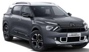
PLATINUM GREY BODY WITH POLAR WHITE ROOF