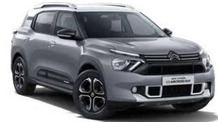
STEEL GREY BODY WITH POLAR WHITE ROOF