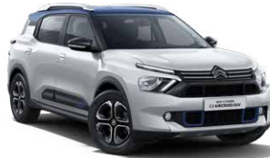
POLAR WHITE BODY WITH COSMO BLUE ROOF