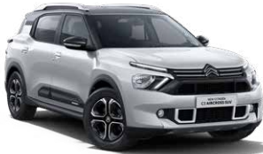
POLAR WHITE BODY WITH PLATINUM GREY ROOF