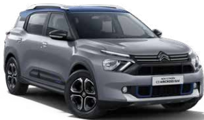
STEEL GREY BODY WITH COSMO BLUE ROOF