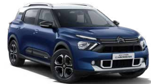
COSMO BLUE BODY WITH POLAR WHITE ROOF