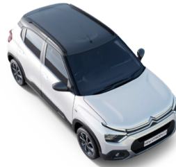
POLAR WHITE BODY WITH PLATINUM GREY ROOF