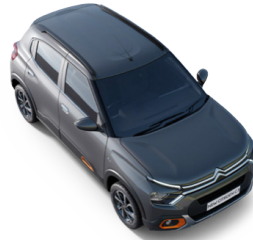
PLATINUM GREY BODY