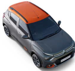
PLATINUM GREY BODY WITH ZESTY ORANGE ROOF