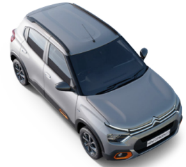
STEEL SILVER BODY