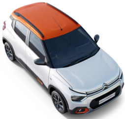
POLAR WHITE BODY WITH ZESTY ORANGE ROOF