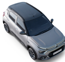
STEEL SILVER BODY WITH PLATINUM GREY ROOF