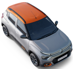
STEEL SILVER BODY WITH ZESTY ORANGE ROOF