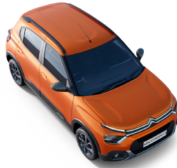
ZESTY ORANGE BODY