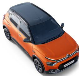
ZESTY ORANGE BODY WITH PLATINUM GREY ROOF