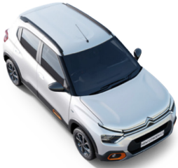
POLAR WHITE BODY